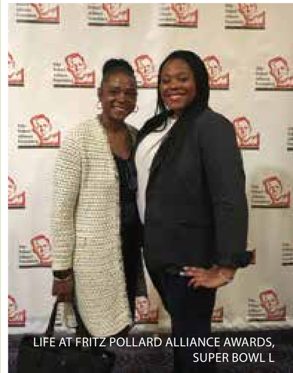
LIFE AT FRITZ POLLARD ALLIANCE AWARDS, SUPER BOWL L